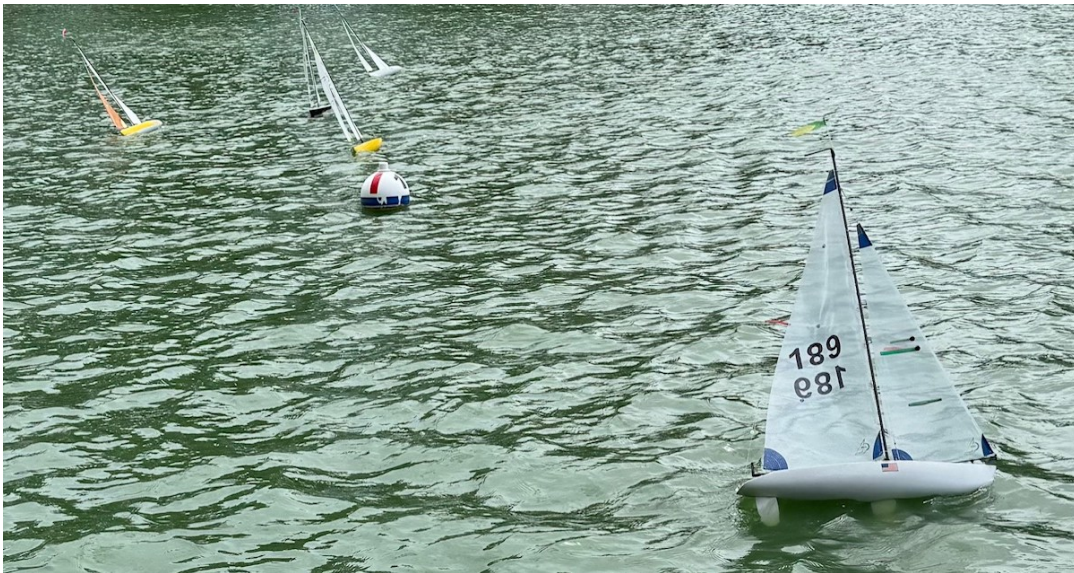
Rounding the mark

Number of races held: 6 Number of throw outs: 1 Throw outs highlighted in grey