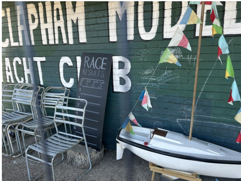
The public score sheet