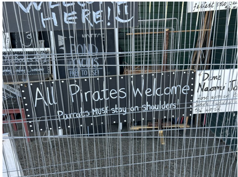
Façade notices -- detail