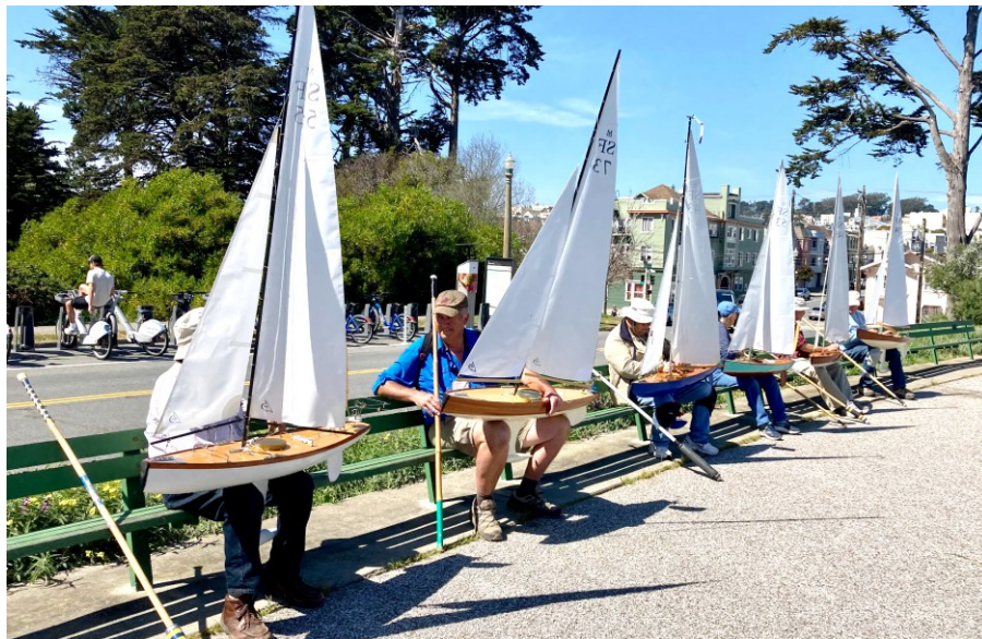
Our M Boat skippers, eager to sail Race 1 of the season

Fat Chance and Pocahontas battle to weather as Dart tempts the south shore