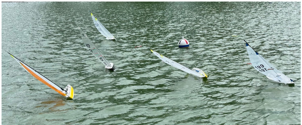
A brisque puff