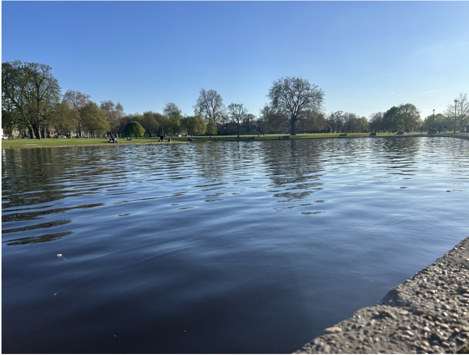
One of the lakes