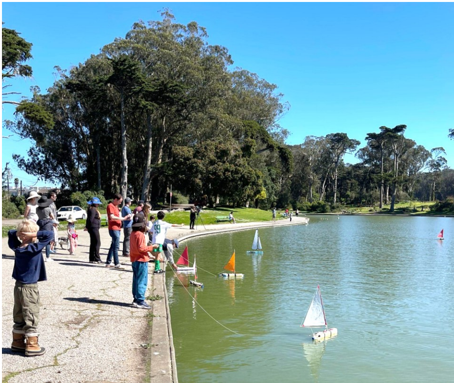
2026 Newest bottle yachts water testing