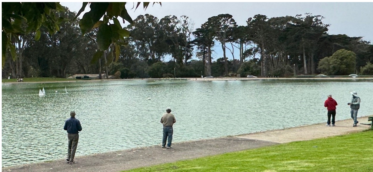
Some of the captains.