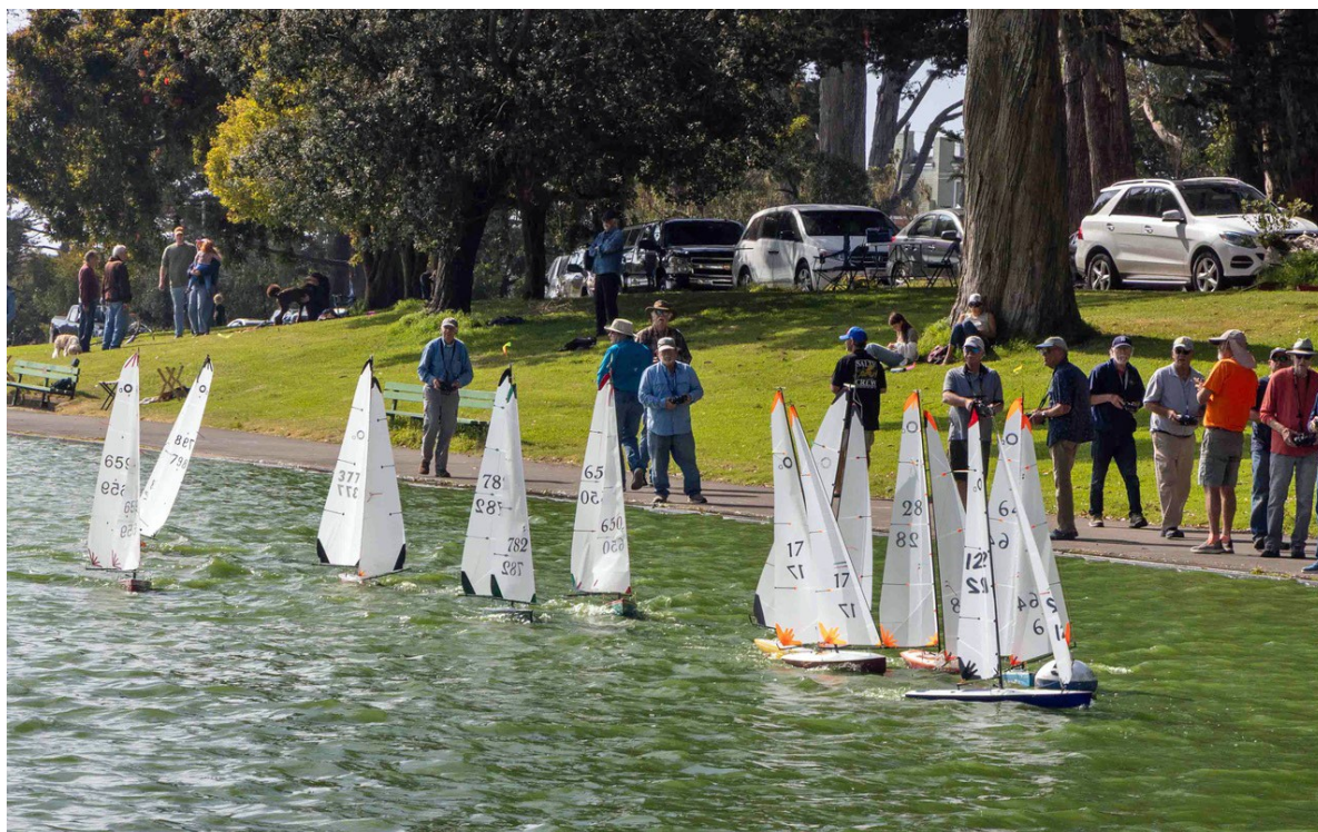
Another large crowd at the leeward mark.