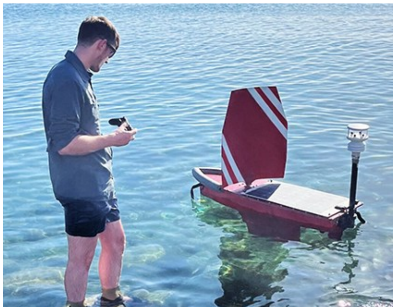
An Oshen C-Star performs its final tests.