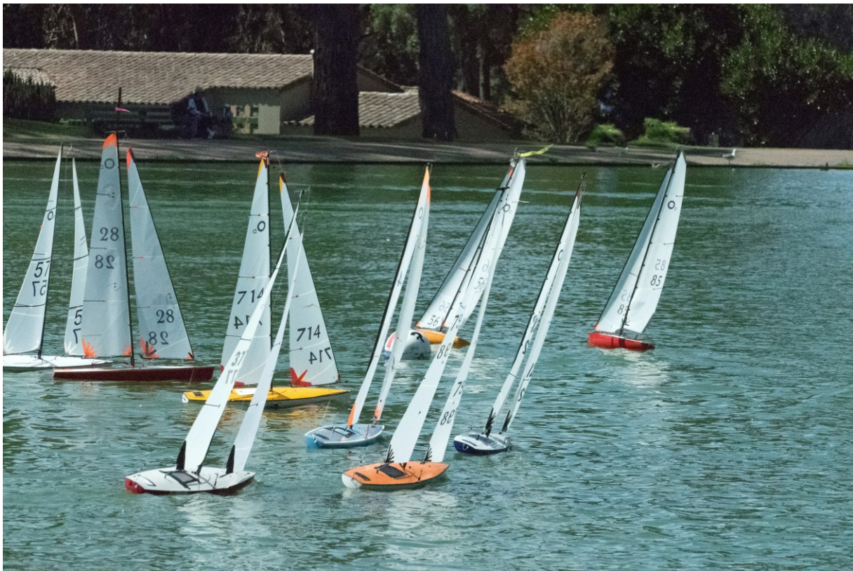
Always crowded at the first mark.