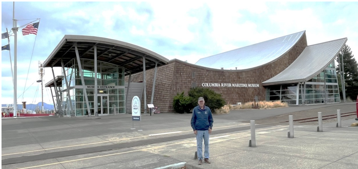
Columbia River Maritime Museum.

A few weeks ago Colleen and I took a driving vacation to British Columbia, Washington, and Oregon. The admiral has asked me to report on our visit to the maritime museum in Astoria, Oregon. It is truly a world class museum devoted to the lower Columbia River with a large portion of the museum recording the overwhelming danger of large waves, generated by the shifting bars.