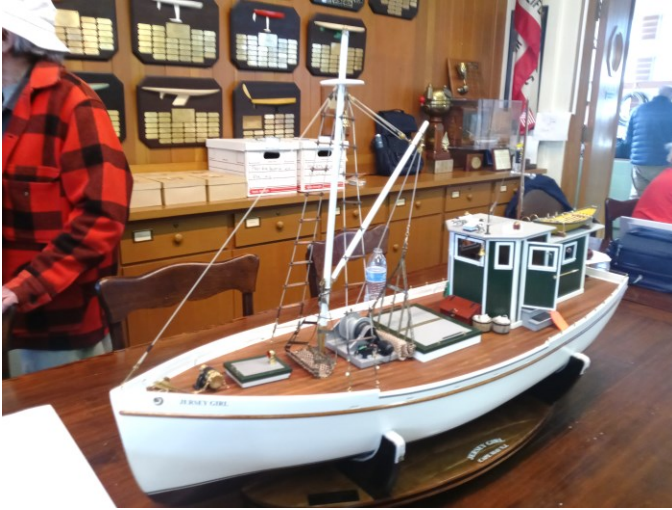
Blaine Russell's 'Jersey Girl'