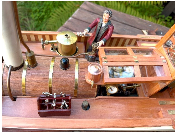
The mechanic, a "hobbit", opens the steam valve