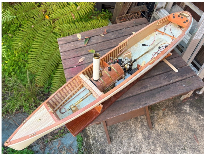
The hull with front deck, interior paneling, boiler, engine, propellor shaft, rudder & servos installed

Part 2 shows some progress in work on the boat – a challenging kit that came with many sticks and sheets of wood, a beautiful fiberglass hull, and some plans that left much to the imagination of the builder, allowing for customization of the many details.