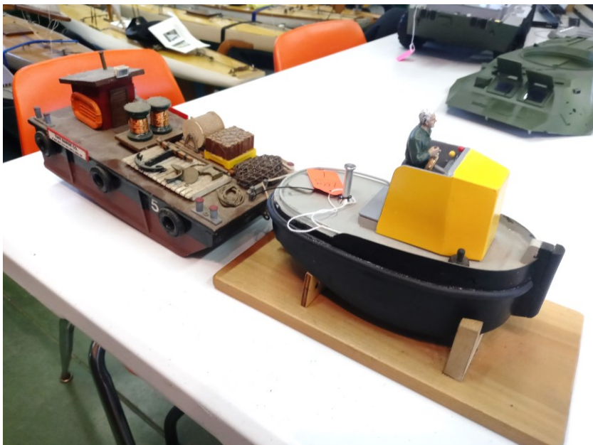
A tiny one-person tug