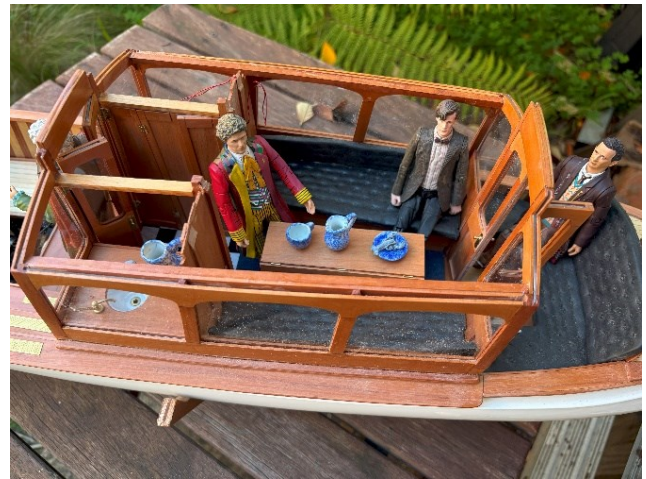
Three iterations of "Dr. Who" take tea in the salon,