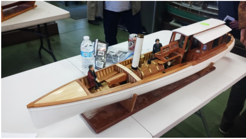
Rick Weiss' (in-progress) live steam, pleasure launch (see Workshop)