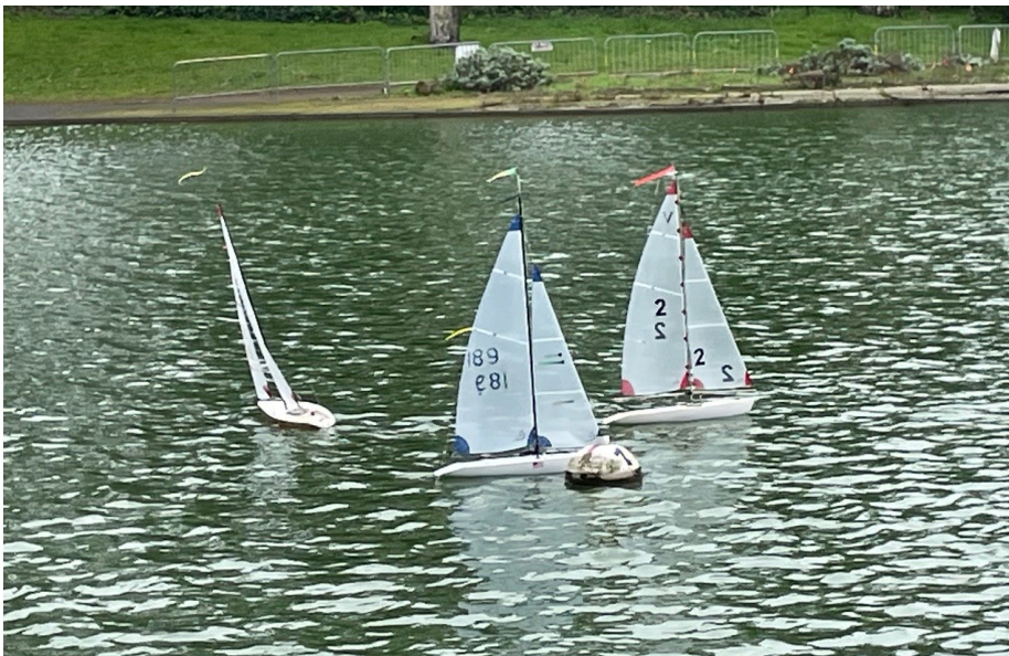
Plenty of excitement at the mark roundings.