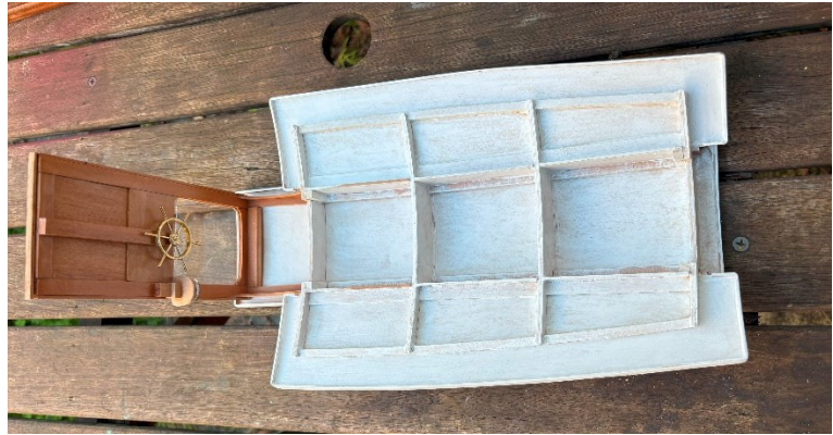
Salon roof framing & helm station.

The contoured salon roof frame includes the helm station, all fit in snugly together with the hinged engine hood.