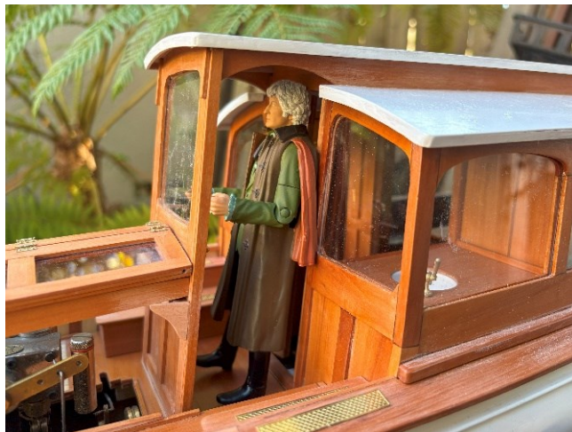
While another takes the helm

Stay tuned to this Newsletter for the future Part 3. Hopefully, the ballast, finishes, bright work, lighting, and fittings will be complete, and the launch tested in a maiden voyage on the lake.