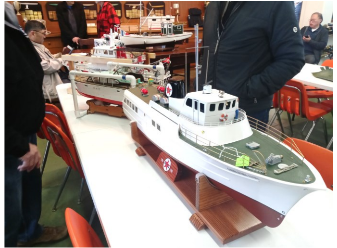
Replica of 'Texico' commercial boat