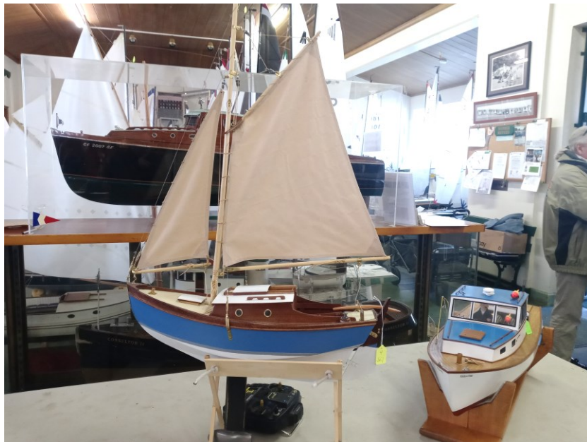
Carl Brosius' "portable" sail boat