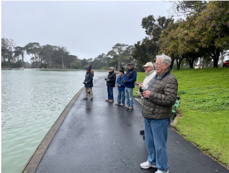
Victoria captains on a drizzly morning.