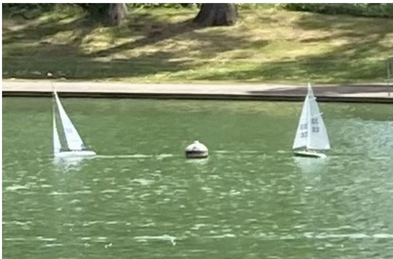
Wally nipping at Jim's transom on the second upwind leg of a little-box/big-box course.