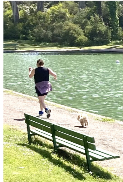
Strider with dog