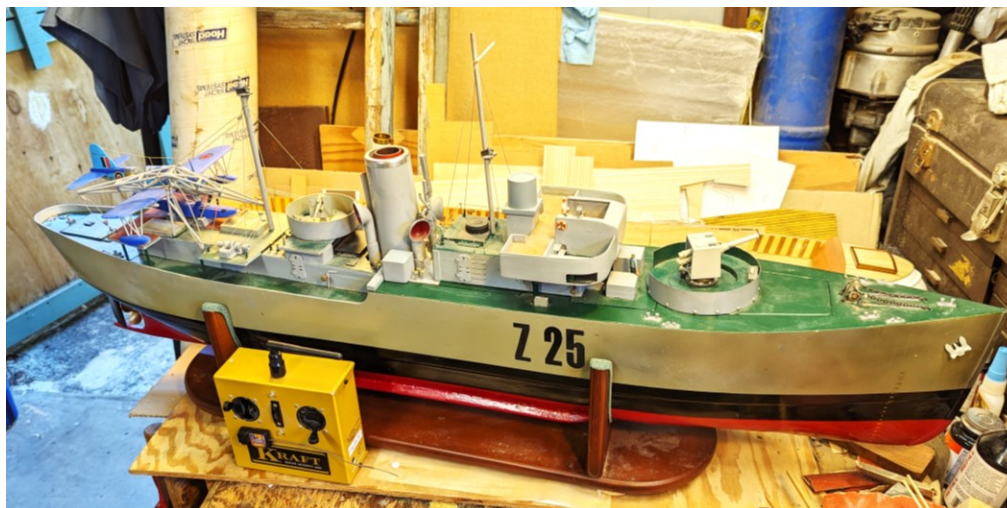
WW2 British reconnaissance boat, Z 25, with amphibious bomber