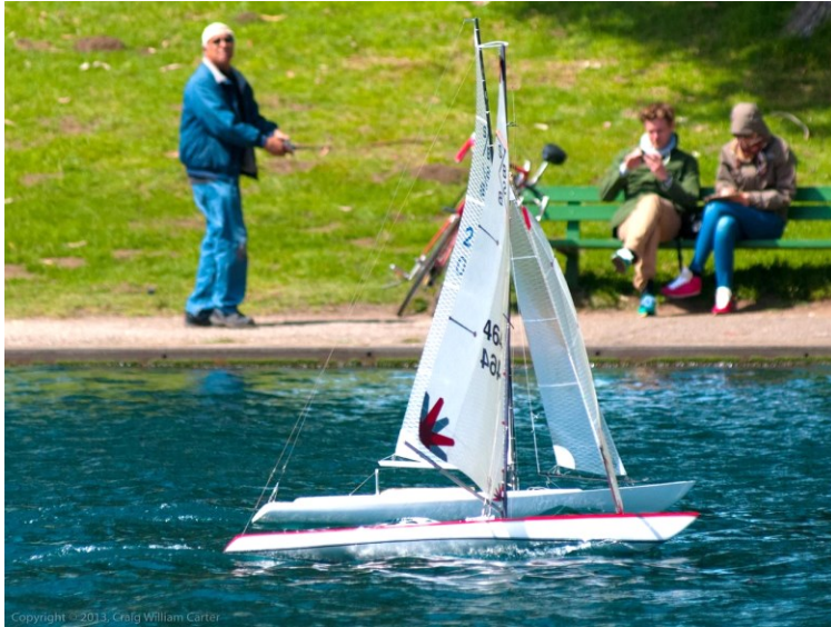
Santa Barbaras, 2013